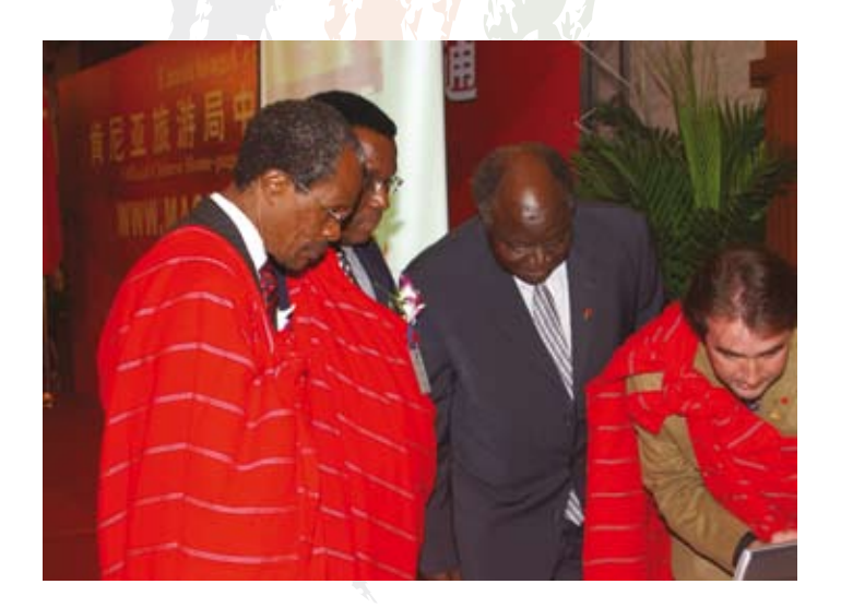
H.E. President Mwai Kibaki: 'Creating high value markets' for Kenya's Tourism

The specific strategies for realising the goals will involve an aggressive strategy to develop Kenya's coast (north and south) by developing resort cities in two key locations; achieving higher tourist revenue yield by increasing the country's premium safari parks and extending facilities in other under-utilised parks; creating new high value niche products (e.g., cultural, eco-, and water-based tourism); revamping business-visitor offering by attracting high-end international hotel chains; and by investing in new conference facilities.