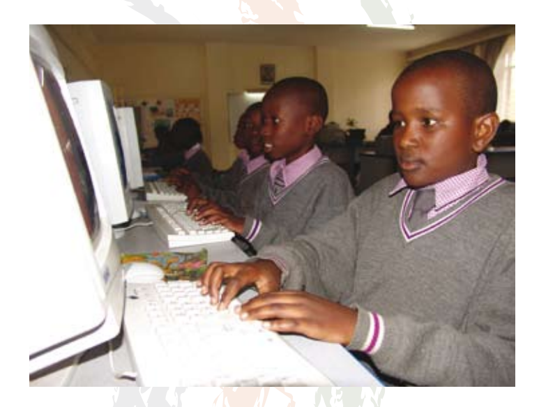
A computer supply programme for Kenyan students

The specific strategies will involve: (i) integrating early childhood into primary education; (ii) reforming secondary curricula; (iii) modernizing teacher training; and (iv) strengthening partnerships with the private sector. Kenya will also develop key programs for learners with special needs, rejuvenate ongoing adult training programmes, and revise the curriculum for university and technical institutes. In partnership with the private sector, the Government will also increase funding to enable all these institutions to support activities envisaged under the economic pillar.